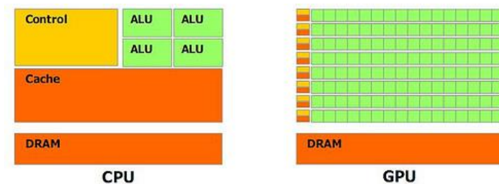
Figure 1. Logical schema of CPU and GPU.

Relative to CPU, GPU has a longer pipeline, and doesn’t have a cache [2] . GPU use more transistors as performing units, rather than as a complex system like cache and control units in CPU which are in order to improve the efficiency of a small amount of execution units [2] . Figure 1 compared the logical schema of CPU and GPU.